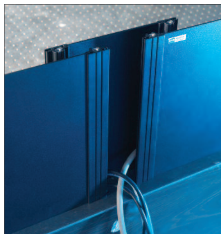
Optoblok enables cable entry using a labyrinth